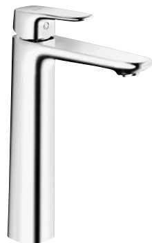
Signature Extended Height Basin Mixer