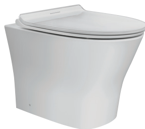
Signature BTW Toilet Pan L560 x W382 x H400mm WELS 4 STAR 4.5 L per full flush / 3 L per half flush 15052.10

Optional Pristine E-bidet Seat: 12881.10