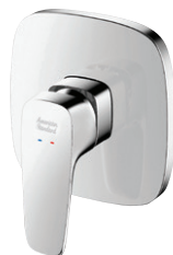
Signature Shower Mixer