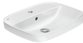
Signature Inset Basin L550 x W430 x H165mm / 1TH 43281.10