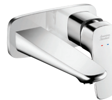
Signature Wall Mount Bath Mixer