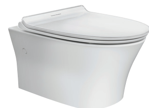
Signature Wall Hung Toilet Pan L550 x W382 x H290mm WELS 4 STAR 4.5 L per full flush / 3 L per half flush

Optional Pristine E-bidet Seat: 12881.10