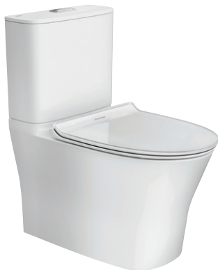
Signature CC BTW Toilet Suite L684 x W406 x H780mm WELS 4 STAR 4.5 L per full flush / 3 L per half flush Top Inlet: 15051.10 Bottom Inlet: 15050.10

Optional Pristine E-bidet Seat: 12881.10