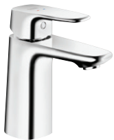
Signature Basin Mixer