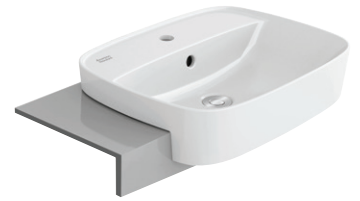
Signature Semi-Recessed Basin L550 x W430 x H170mm / 1TH 43283.10