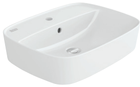
Signature Vessel Basin L550 x W430 x H168mm / 1TH 43285.10