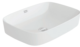
Signature Vessel Basin L550 x W400 x H144mm / NTH 43287.10