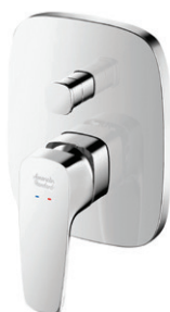
Signature Diverter Mixer