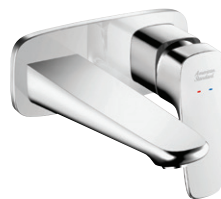
Signature Wall Mount Basin Mixer